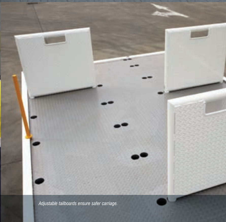
Adjustable tailboards ensure safer carriage.