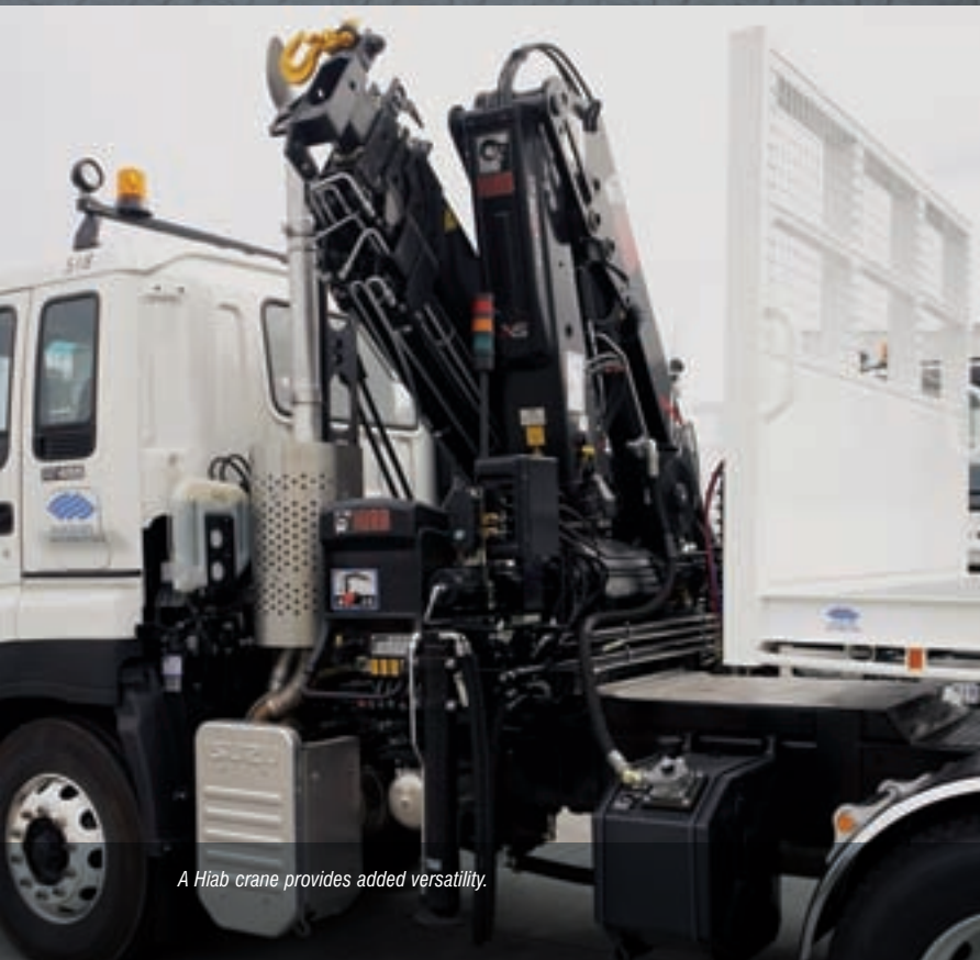
A Hiab crane provides added versatility.

"Complementing this set up are the latest Ausbinder Series Mark II loadbinders - the sum of all, is extremely secure and safe transportation for everyone involved in the distribution process along with other road users."