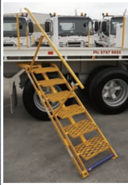
Trailers feature an in-built retractable ladder with handrail.

"The combination of anti-lock brakes, driver airbag and ECE-R29 compliant cab makes for a safe driving experience, while features including the Isri air suspension seat, automated manual transmission and 455 horsepower all provide a comfortable and stress-free driving environment."