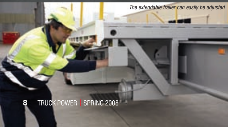
The extendable trailer can easily be adjusted.

It takes a steely resolve to make it in the construction industry; the high safety demands and pressure to deliver on time requires a proactive and innovative approach to ensure success.